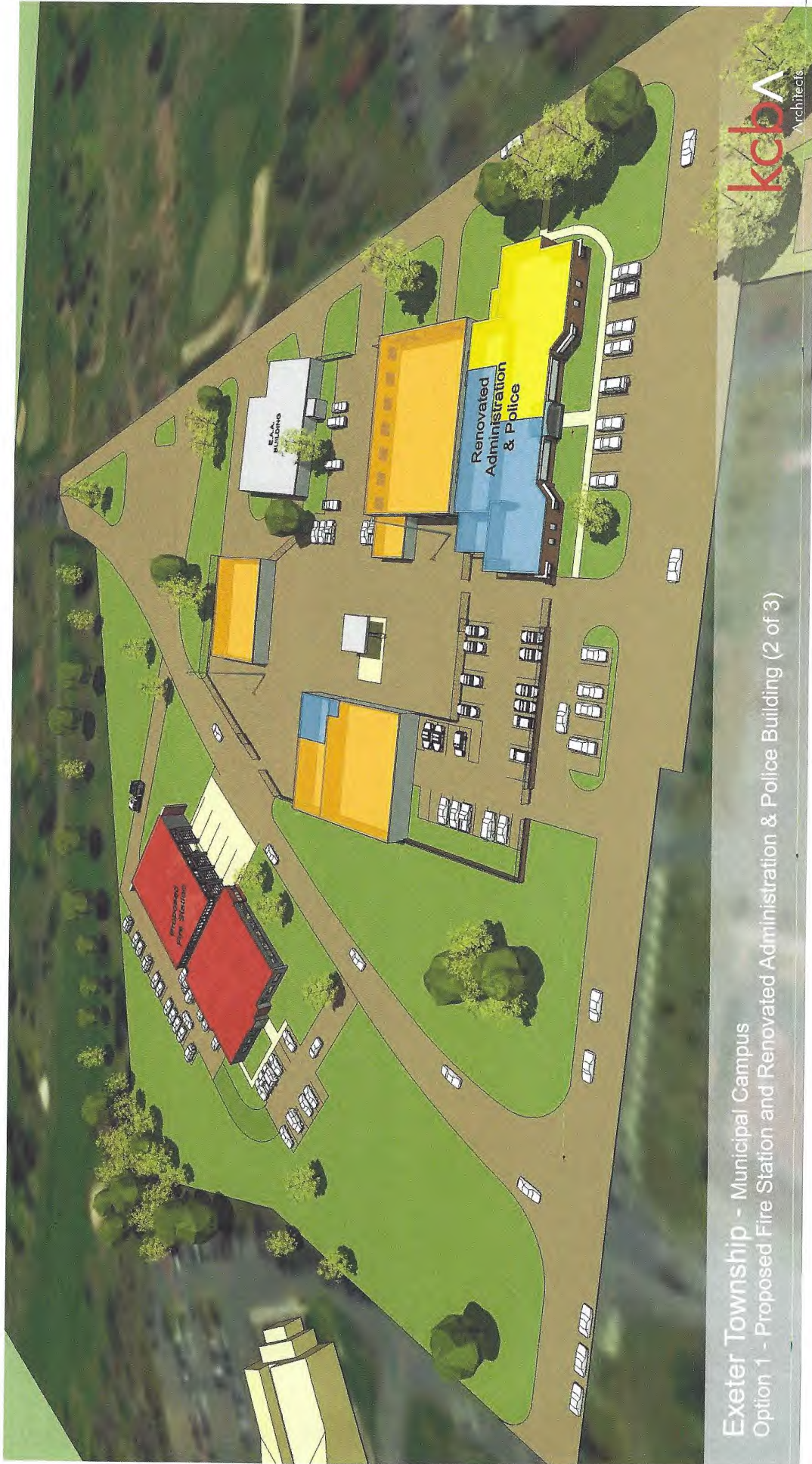
Exeter Township - Municipal Campus Option 1 - Proposed Fire Station and Renovated Administration & Police Building (2 of 3)