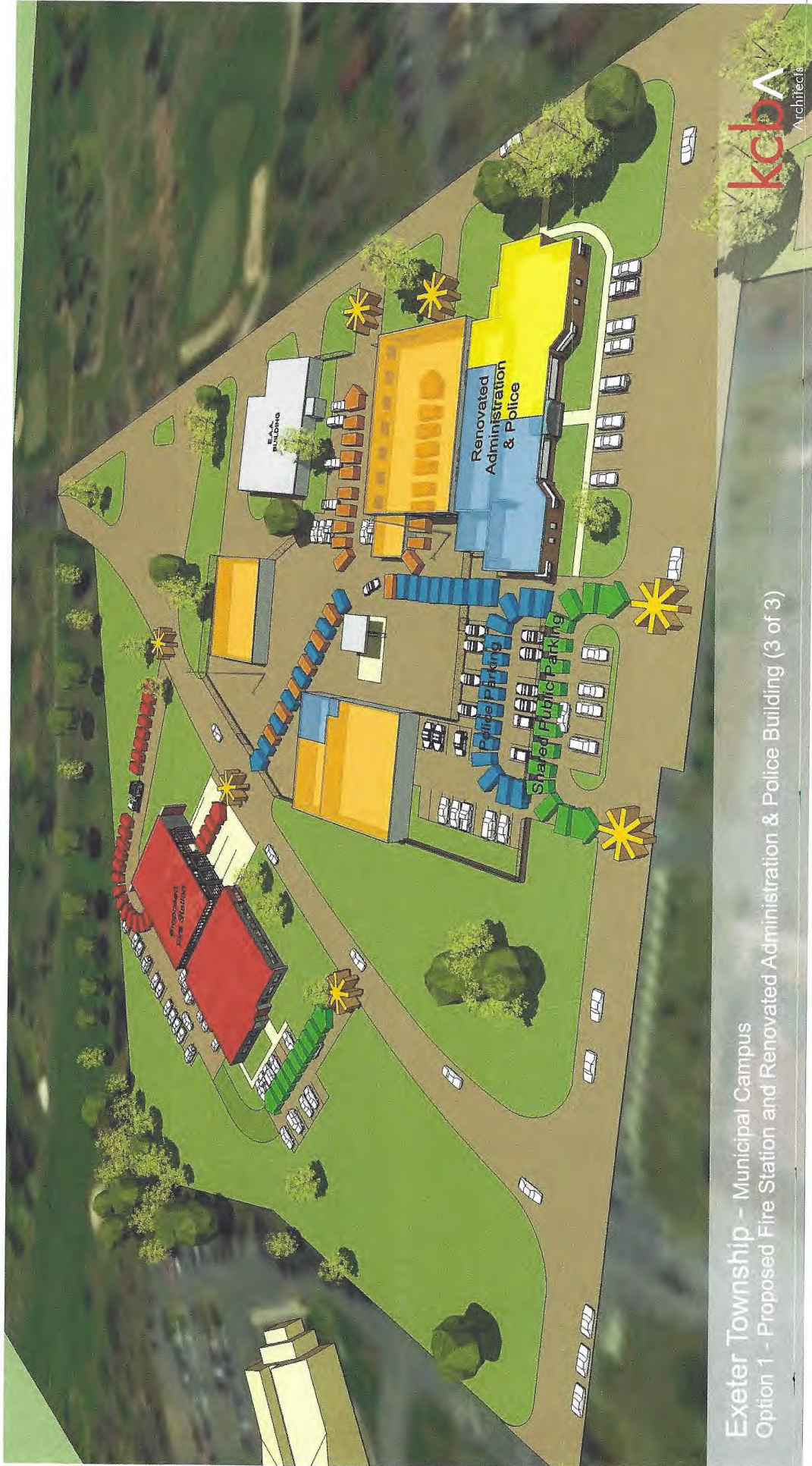
Exeter Township - Municipal Campus Option 1 - Proposed Fire Station and Renovated Administration & Police Building (3 of 3)