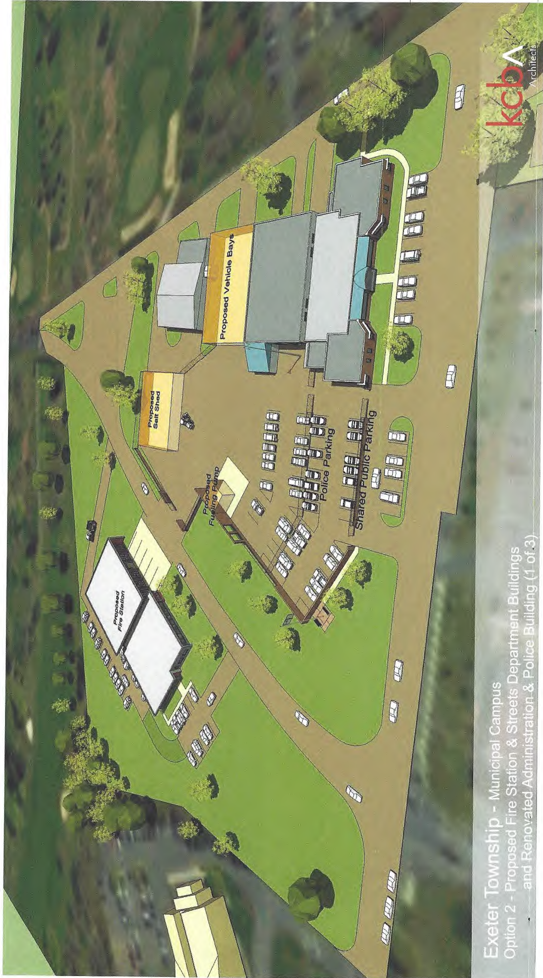
Exeter Township - Municipal Campus Option 2 - Proposed Fire Station & Streets Department Buildings and Renovated Administration & Police Building (1 of 3)