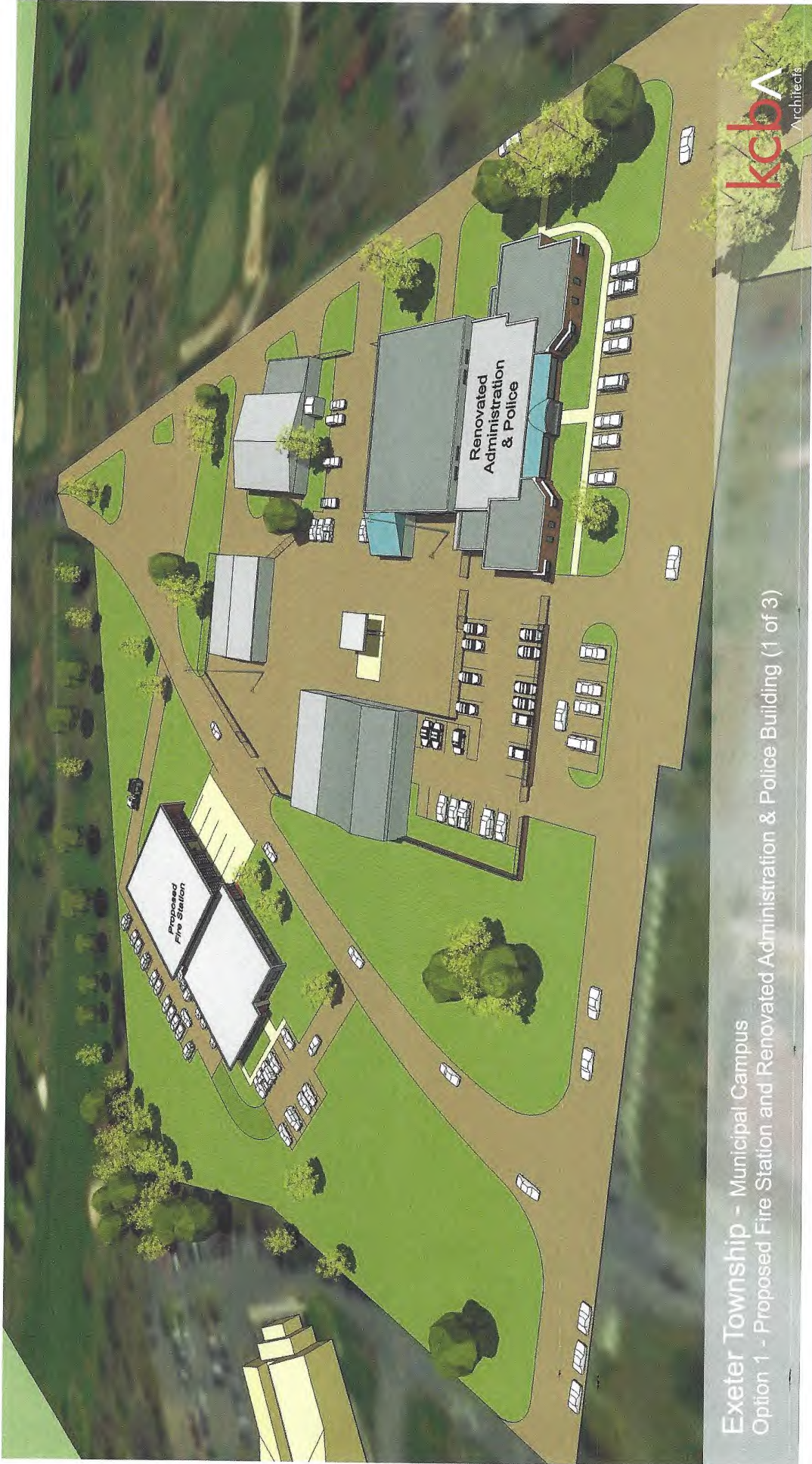
Exeter Township - Municipal Campus Option 1 - Proposed Fire Station and Renovated Administration & Police Building (1 of 3)