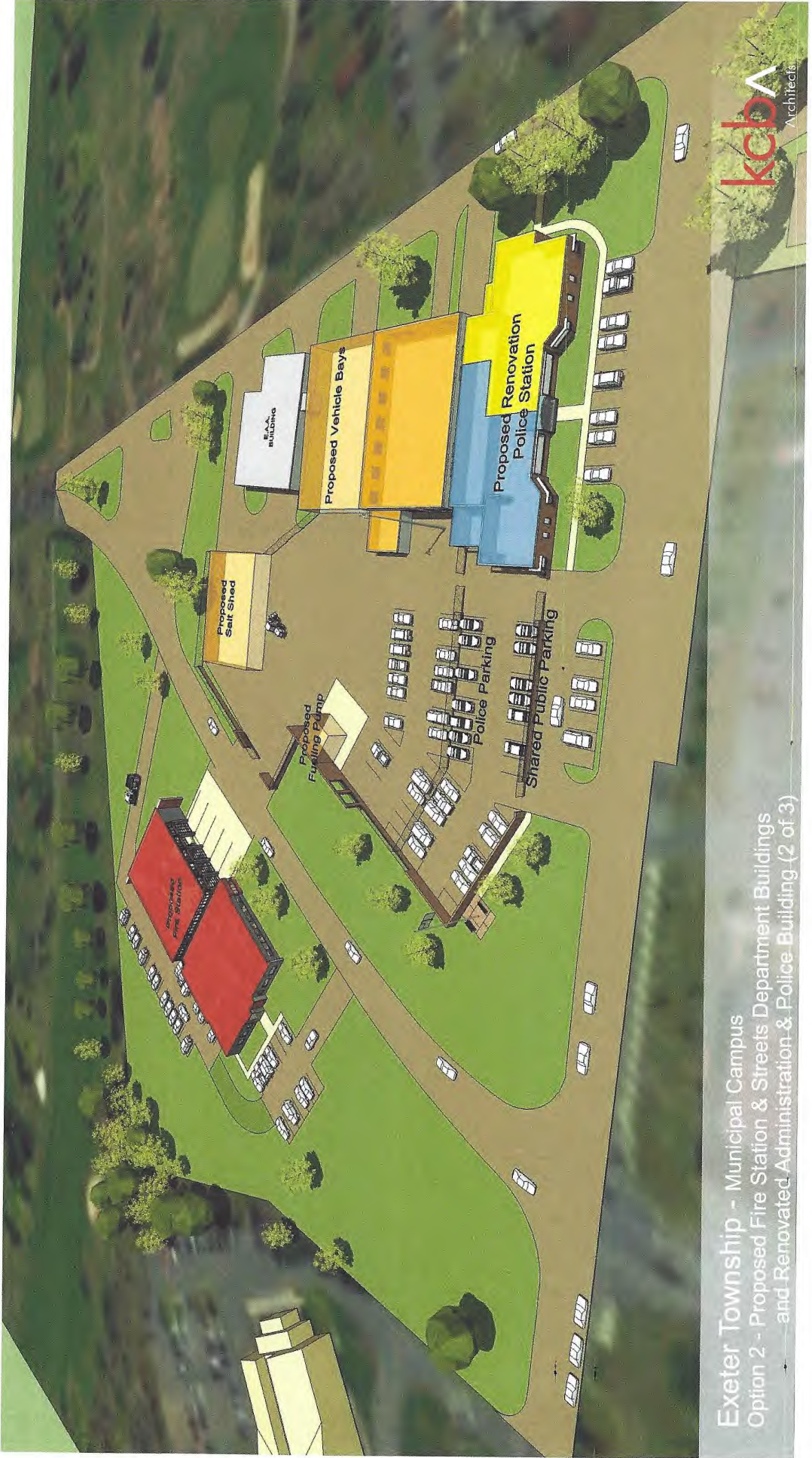
Exeter Township - Municipal Campus Option 2 - Proposed Fire Station & Streets Department Buildings and Renovated Administration & Police Building (2 of 3)