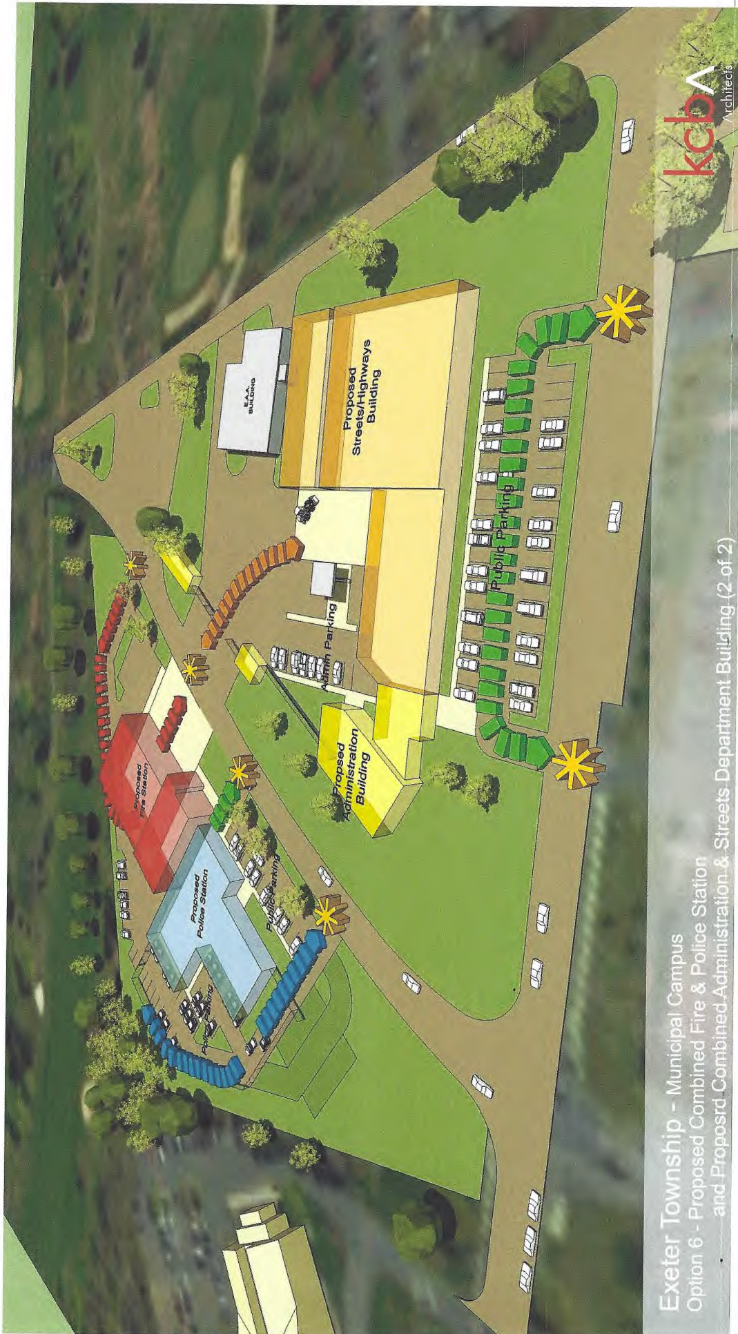
Exeter Township - Municipal Campus Option 6 - Proposed Combined Fire & Police Station and Proposed Combined Administration & Streets-Department Building (2 of 2)