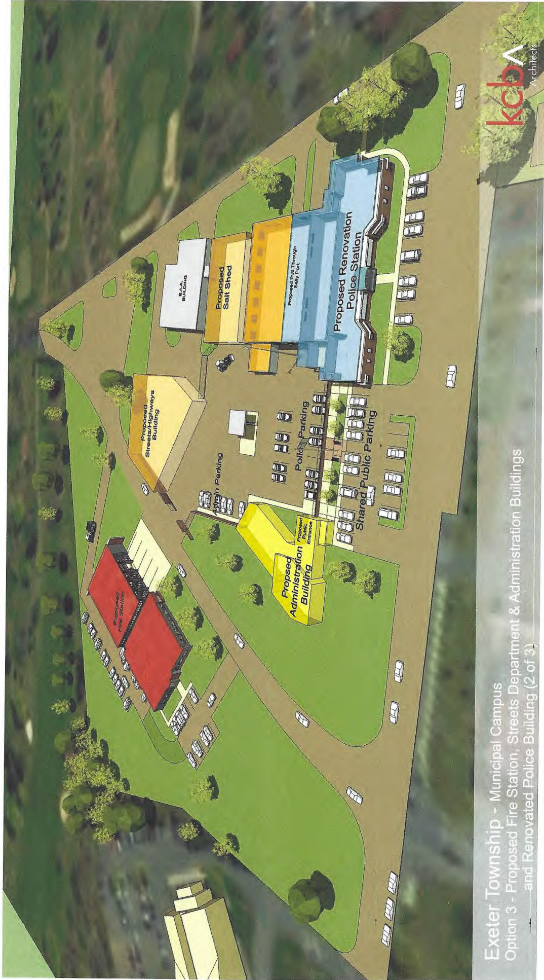
Exeter Township - Municipal Campus Option 3 - Proposed Fire Station, Streets Department & Administration Buildings and Renovated Police Building (2 of 3)