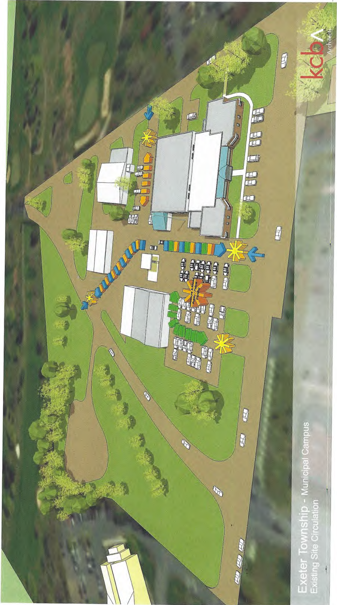
Exeter Township - Municipal Campus Existing Site Circulation