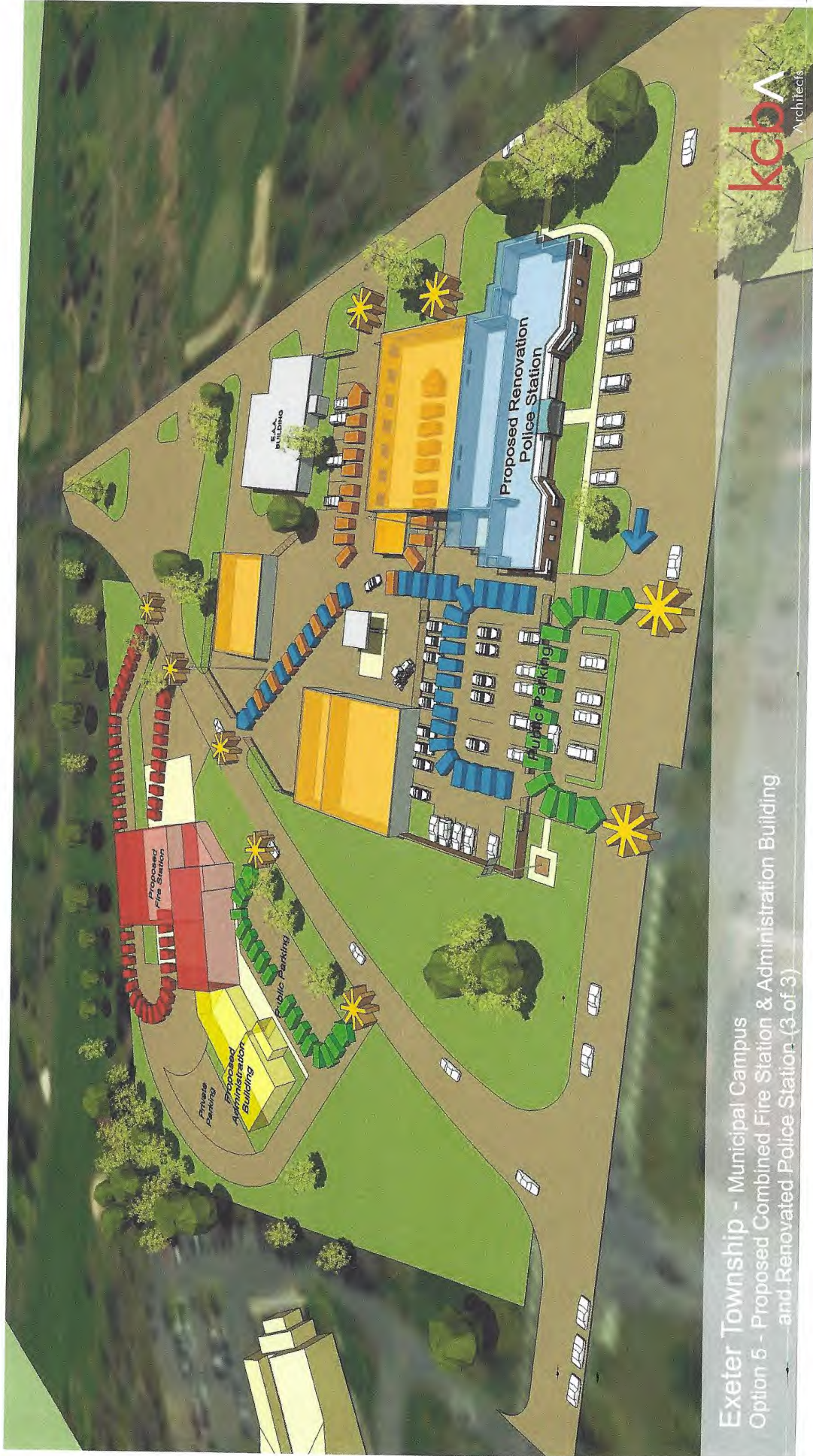
Exeter Township - Municipal Campus Option 5 - Proposed Combined Fire Station & Administration Building and Renovated Police Station (3 of 3)