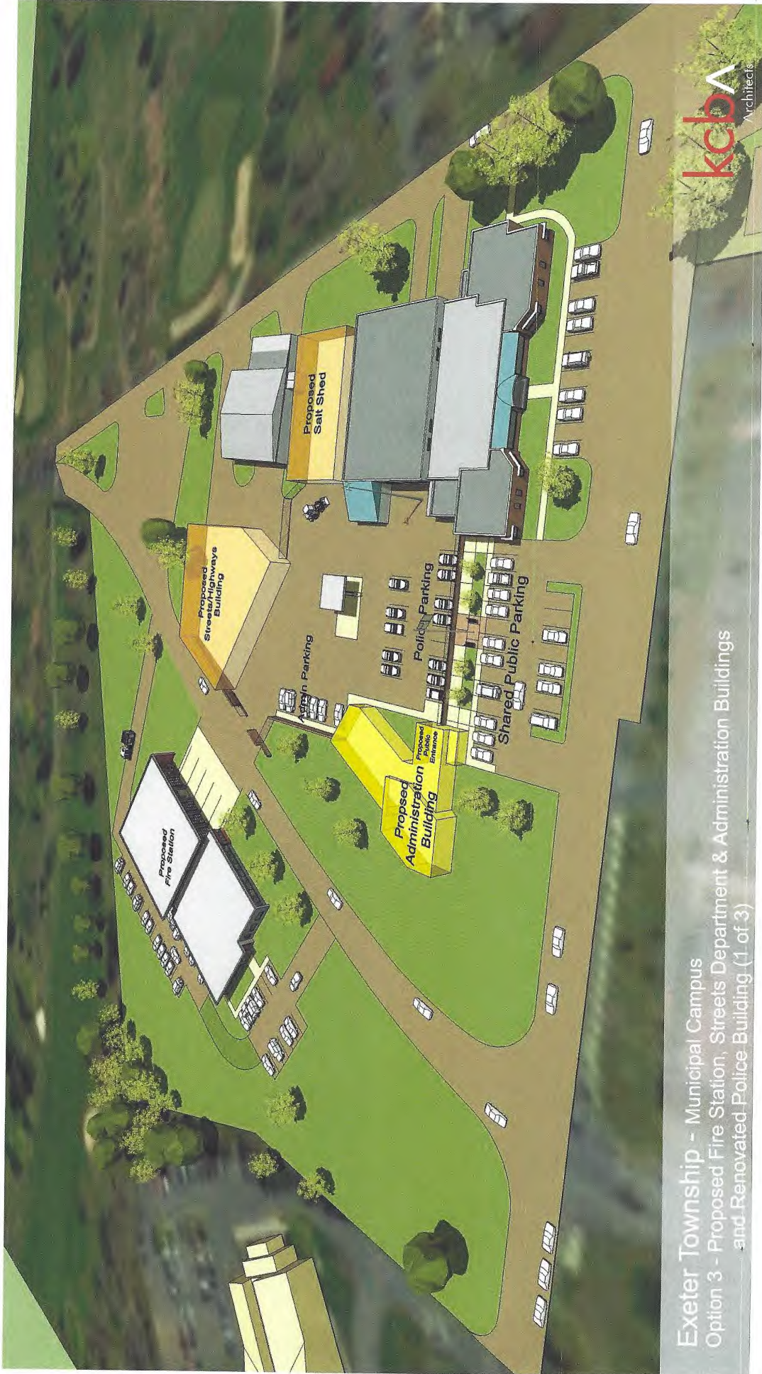
Exeter Township - Municipal Campus Option 3 - Proposed Fire Station, Streets Department & Administration Buildings and Renovated Police Building (1 of 3)