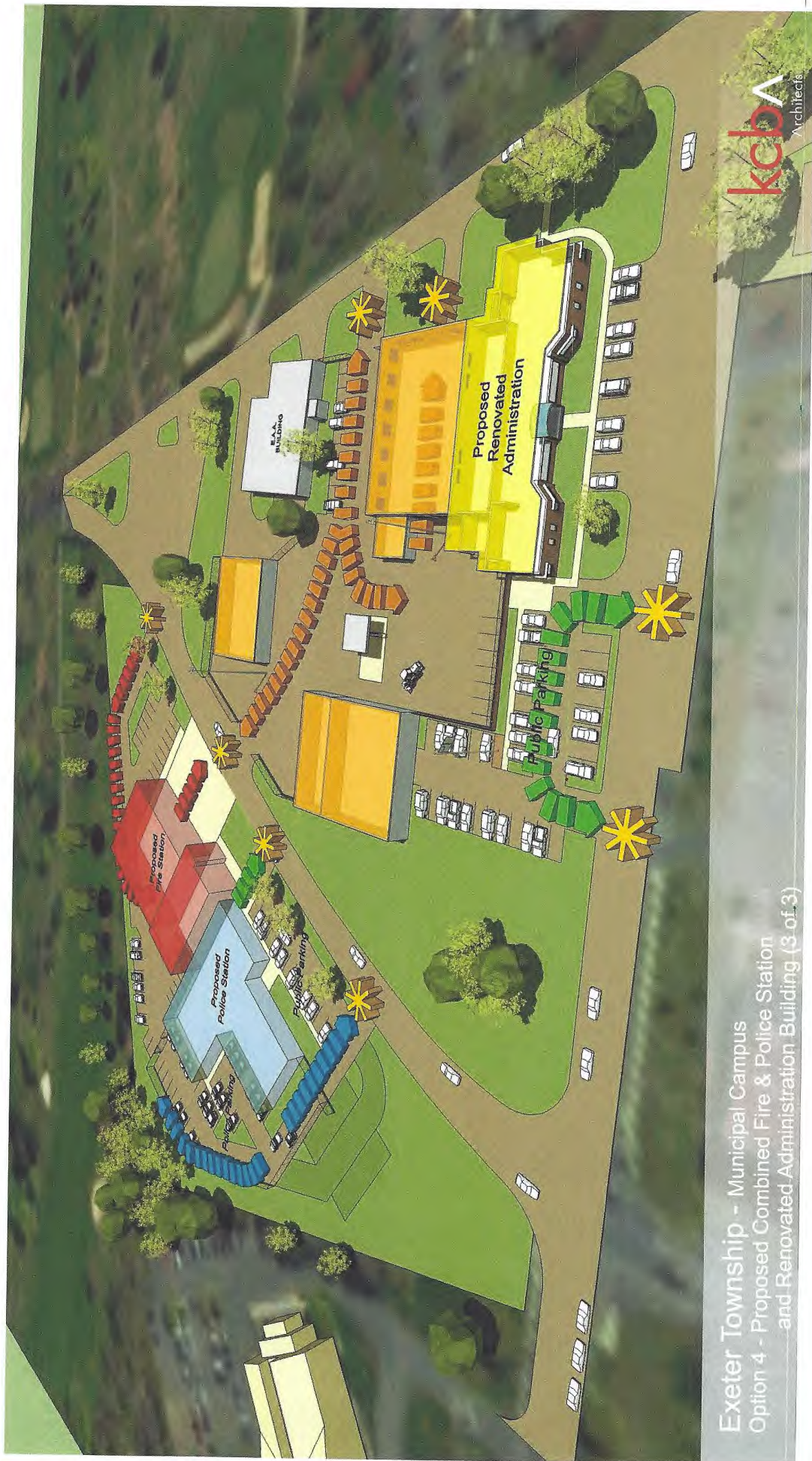
Exeter Township - Municipal Campus Option 4 - Proposed Combined Fire & Police Station and Renovated Administration Building (3 of 3)