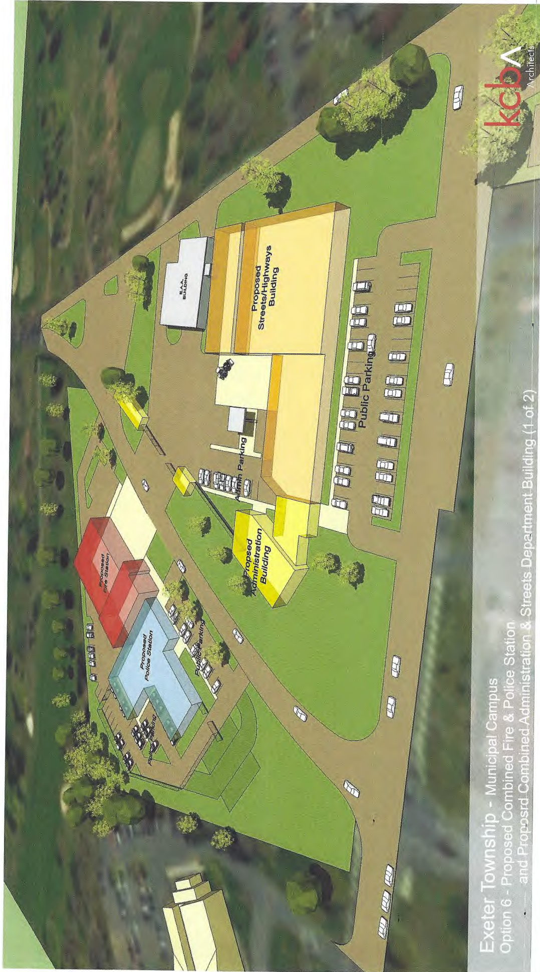
Exeter Township - Municipal Campus Option 6 - Proposed Combined Fire & Police Station and Proposed Combined Administration & Streets Department Building (1 of 2)