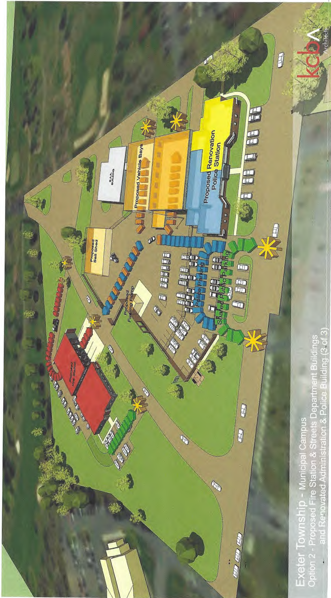
Exeter Township - Municipal Campus Option 2 - Proposed Fire Station & Streets Department Buildings and Renovated Administration & Police Building (3 of 3)