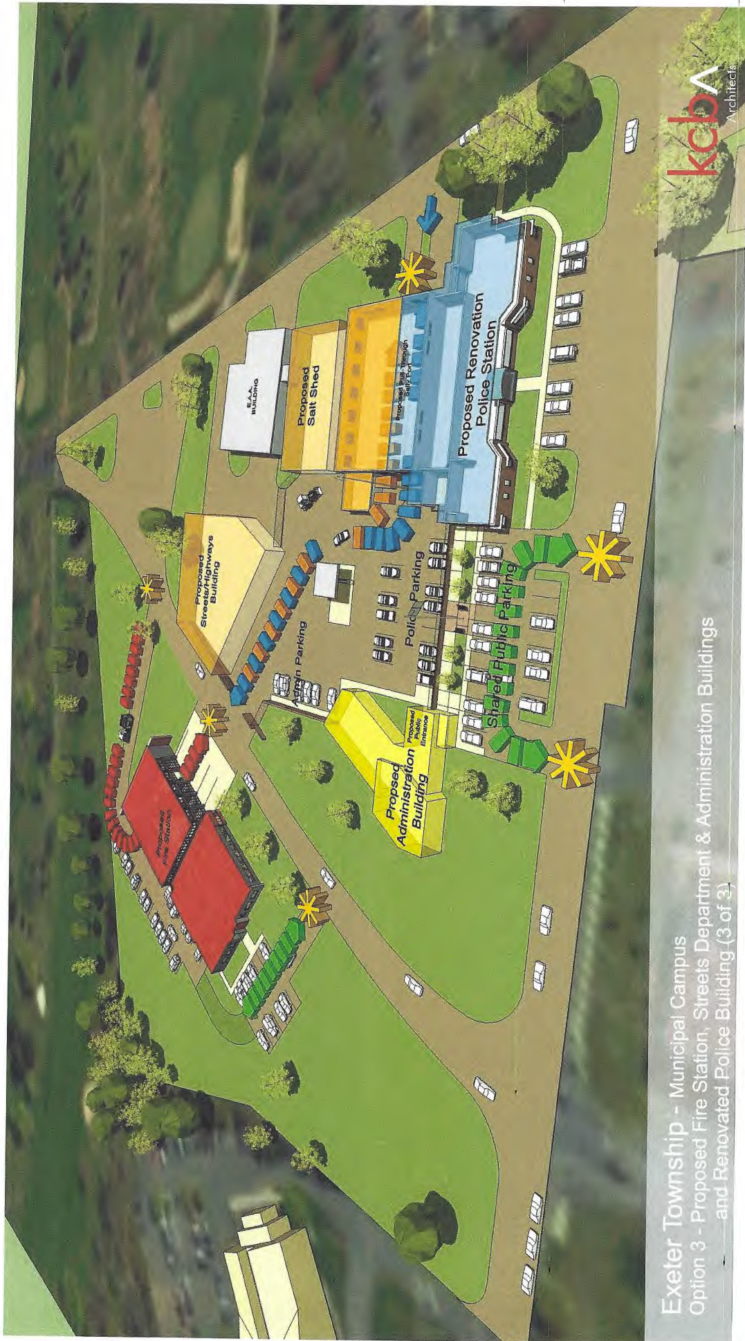
Exeter Township - Municipal Campus Option 3 - Proposed Fire Station, Streets Department & Administration Buildings and Renovated Police Building (3 of 3)