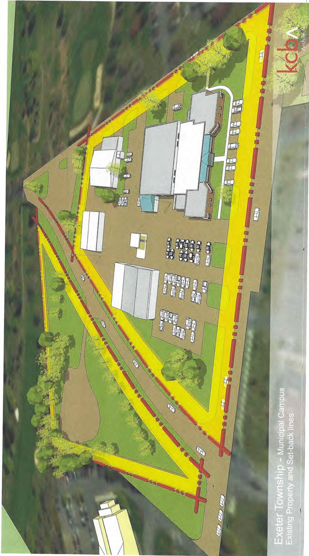
Exeter Township - Municipal Campus Existing Property and Set-back lines