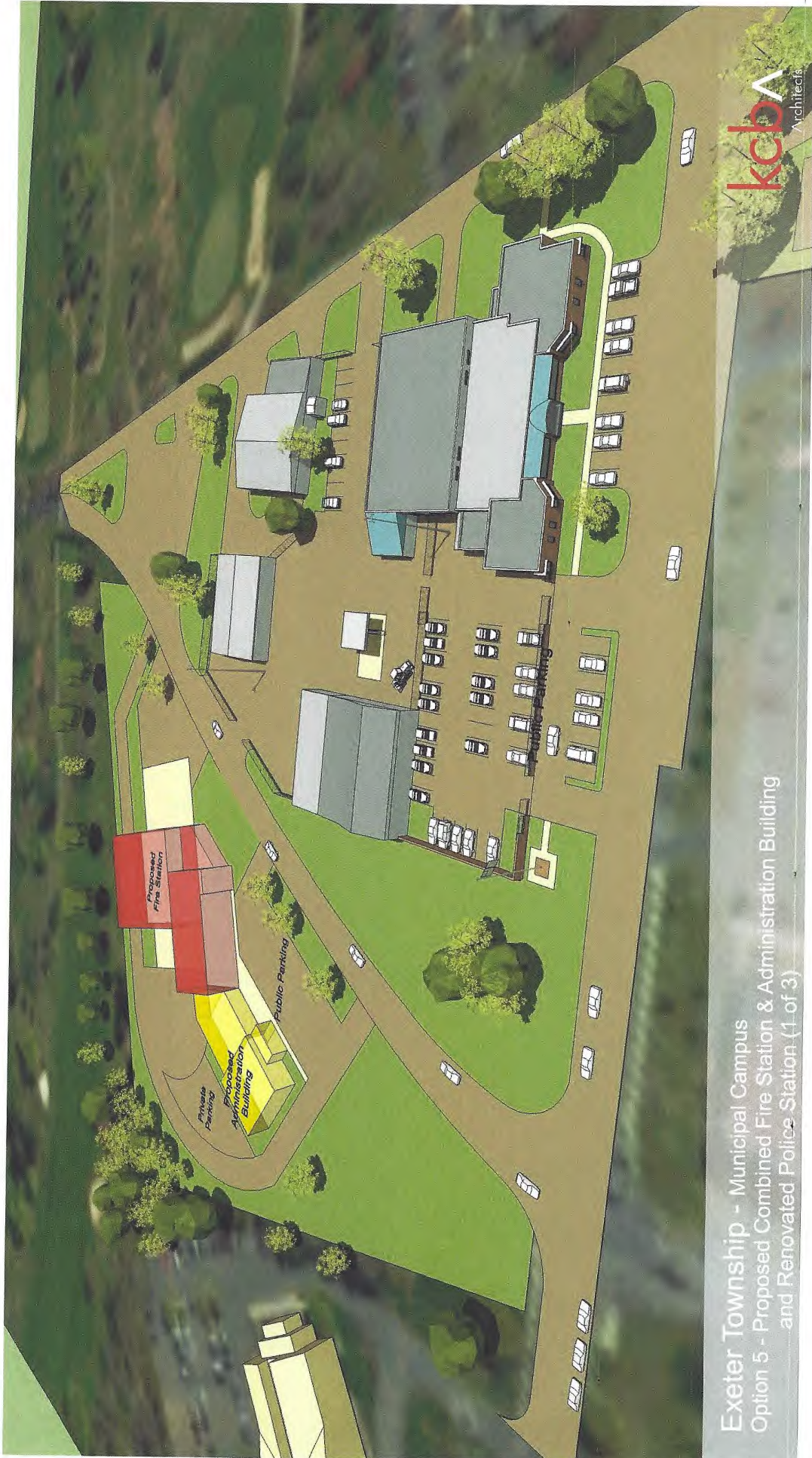
Exeter Township - Municipal Campus Option 5 - Proposed Combined Fire Station & Administration Building and Renovated Police Station (1 of 3)