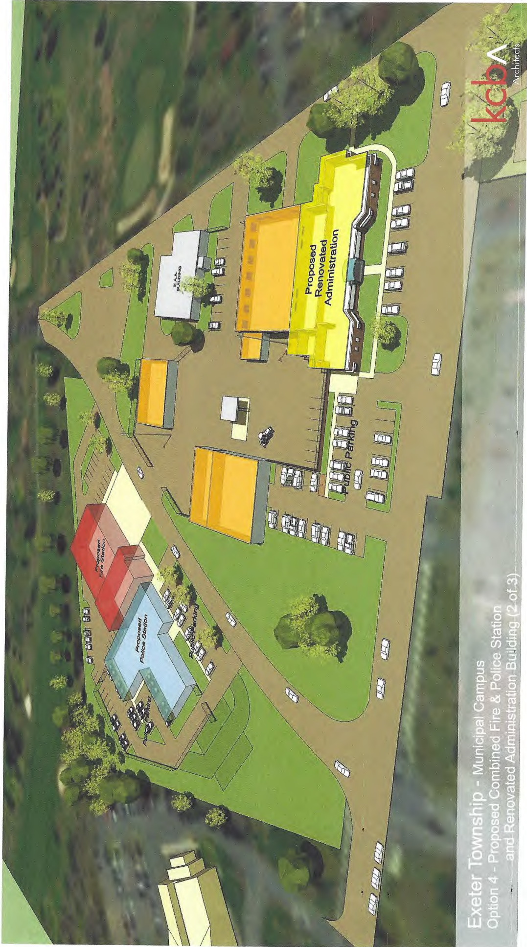
Exeter Township - Municipal Campus Option 4 - Proposed Combined Fire & Police Station and Renovated Administration Building (2 of 3)