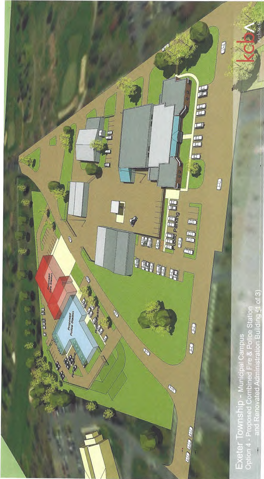
Exeter Township - Municipal Campus Option 4 - Proposed Combined Fire & Police Station and Renovated Administration Building (1 of 3)