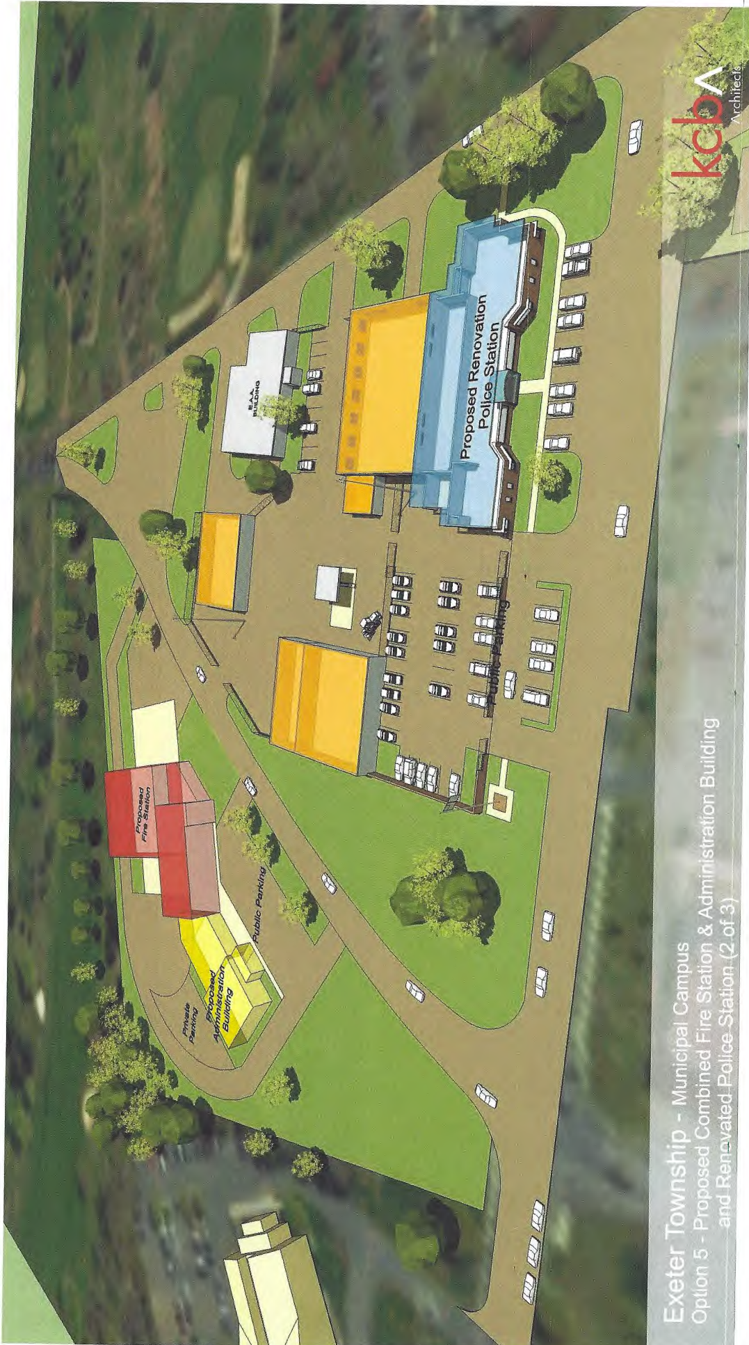
Exeter Township - Municipal Campus Option 5 - Proposed Combined Fire Station & Administration Building and Renovated Police Station (2 of 3)